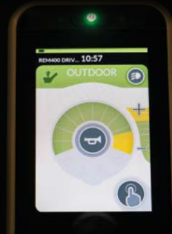
Tap operation – Right hand use