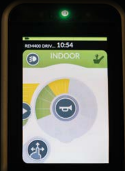
Swipe operation – Left hand use