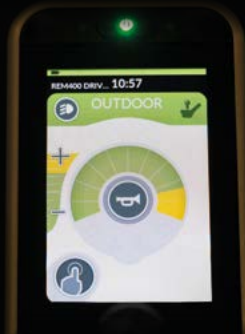
Tap operation – Left hand use