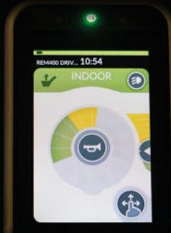
Swipe operation – Right hand use