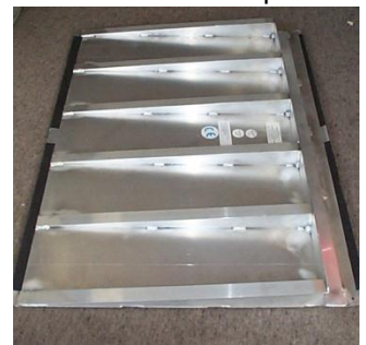
Underside of a TH2432 & TH2436 ramp